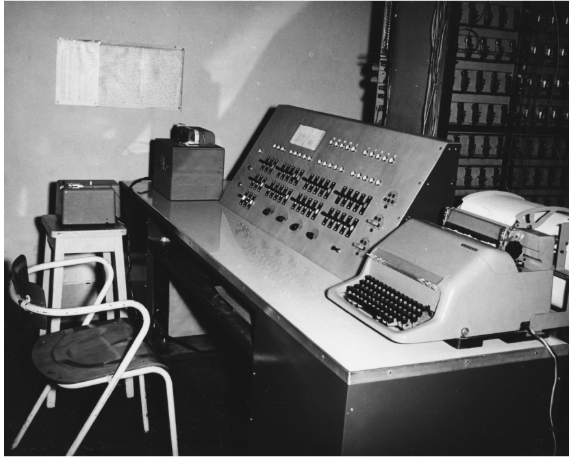
Fig. 1 – The only surviving photo of the Manual Control Panel of the 1957 MR